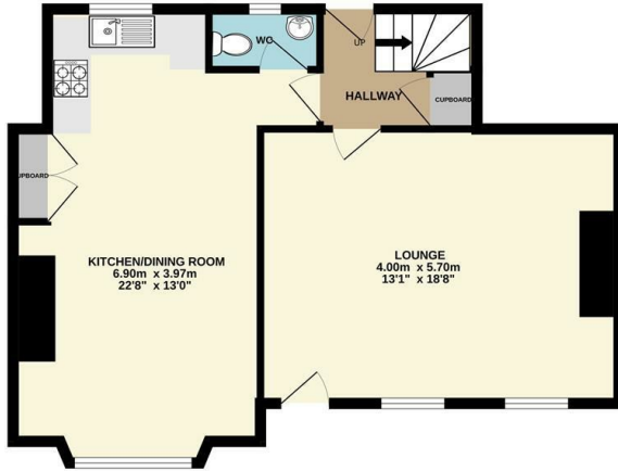
1ST FLOOR 54.7 sq.m. (589 sq.ft.) approx.